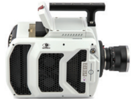
v1612 with 2TB CineMag

Phantom ® v2512 Phantom ® v2012 Phantom ® v1612 Phantom ® v1212