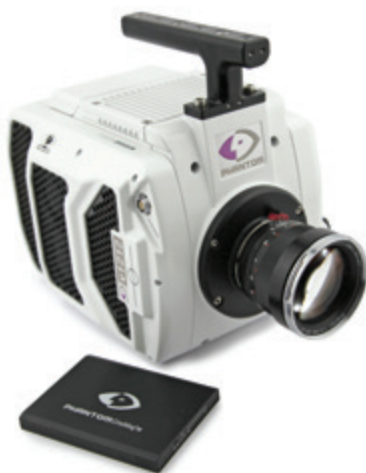
Phantom v1212 with CineMag®