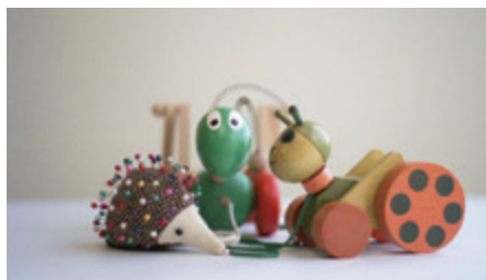
E.I. 40,000 applied