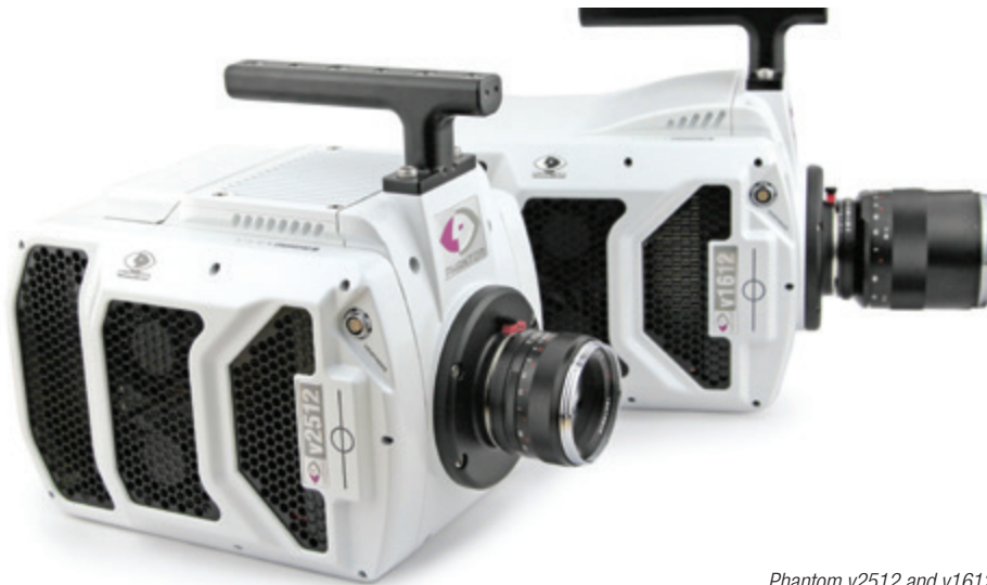
Phantom v2512 and v1612

For the most current version visit www.phantomhighspeed.com Subject to change Rev June 2017